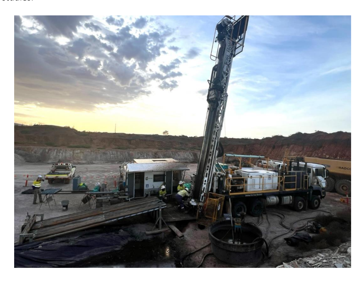
Figure 1: Terra diamond drill rig at Nifty