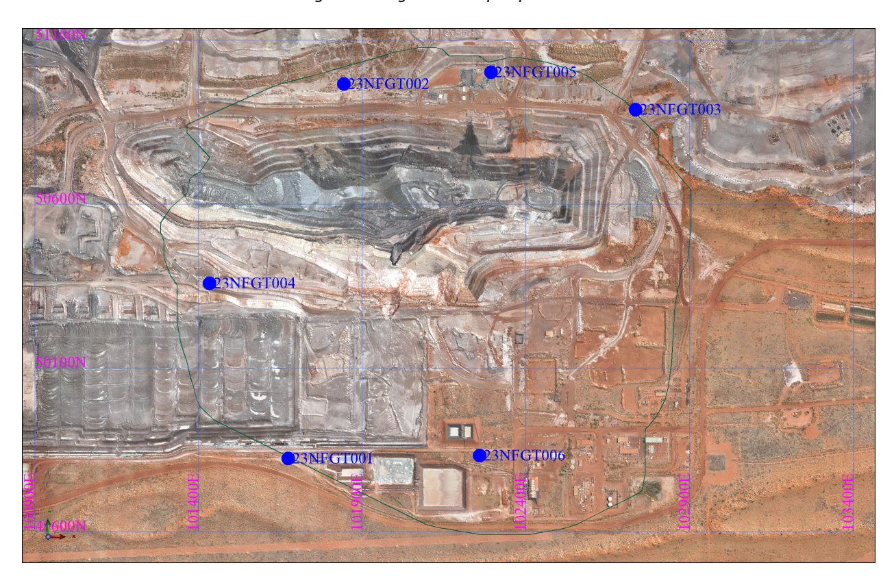
Figure 3: Geotechnical diamond drillhole collars