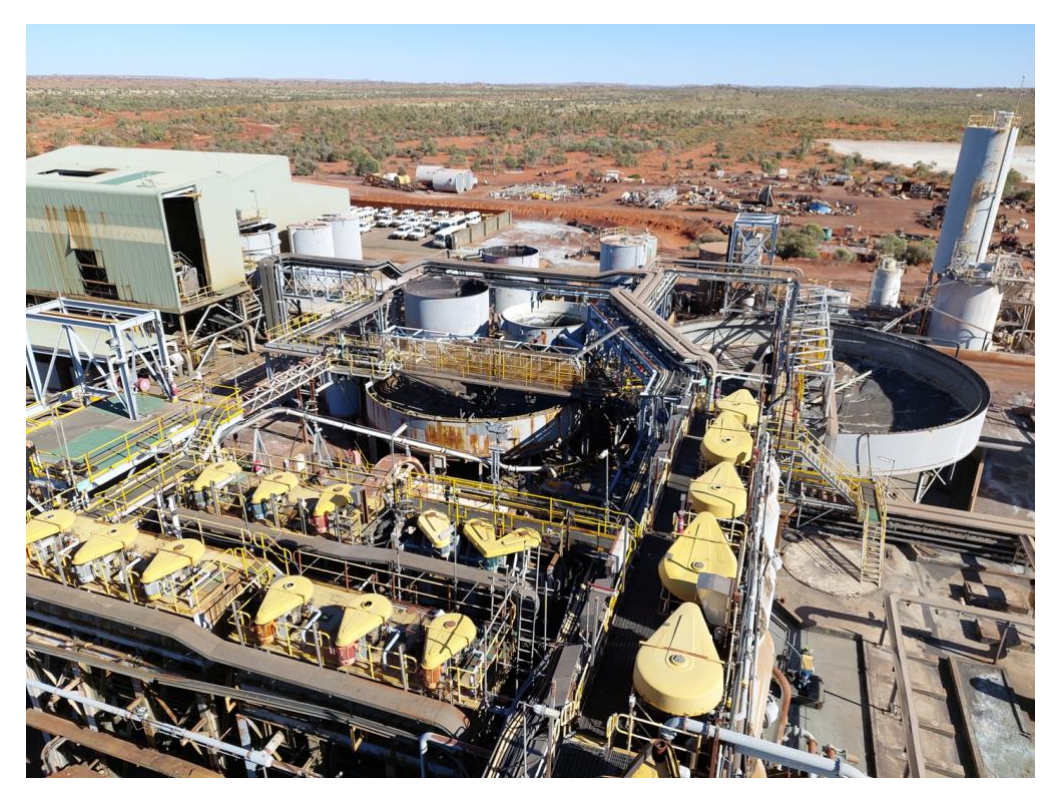
Figure 4: Nifty Concentrator