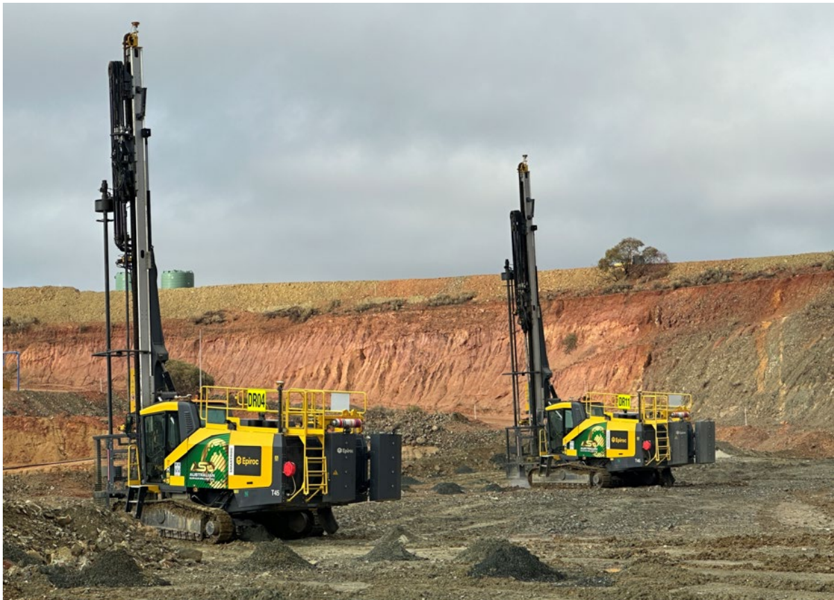
Figure 1: ASD Drilling at MacPhersons pit on 26 th February 2024

Mining continued at the MacPhersons Reward project during the quarter with two Beacon owned 100t mining fleets. Production rates increased during the quarter as a third mining shift was introduced to expedite the extraction of ore in Q4 2024. Drill and blast activities ramped up during the quarter with contractor Australian Surface Drilling (ASD) mobilising 3 drill rigs to site.