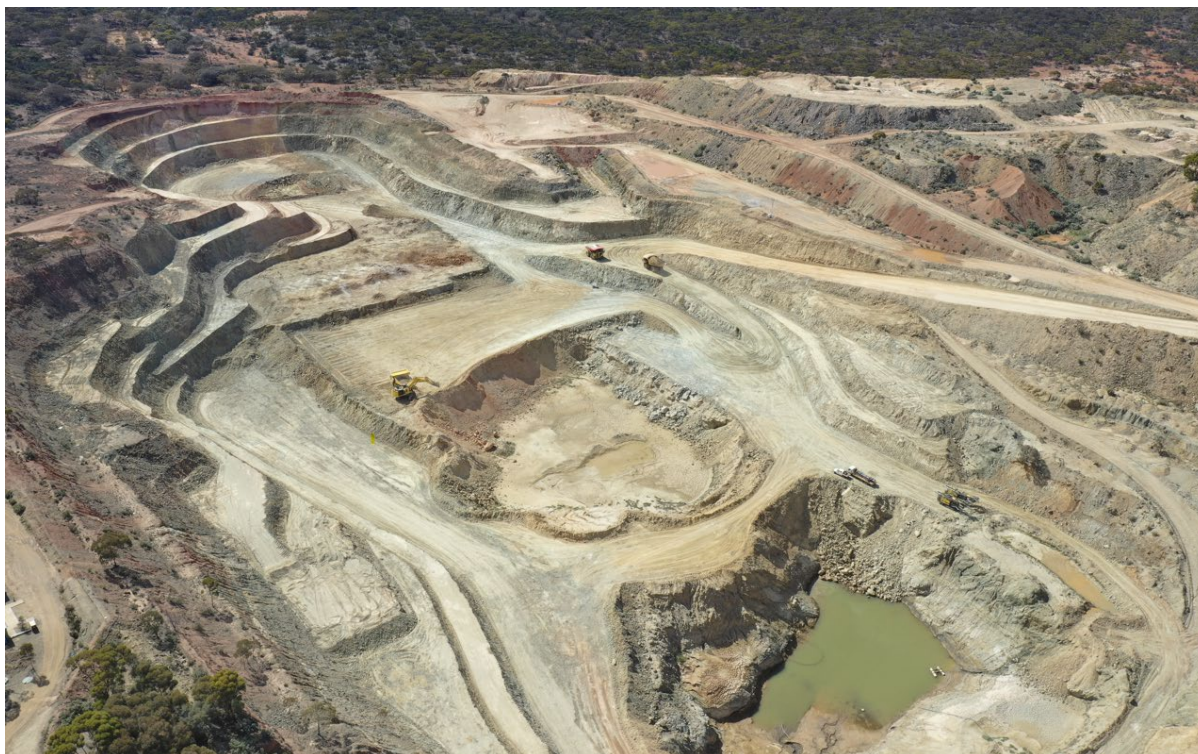
Figure 2: MacPhersons pit on 4 th April 2024