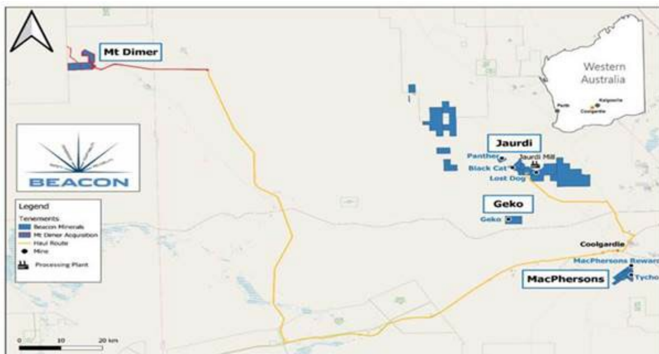
Figure 5 – Location of the Mt Dimer Project