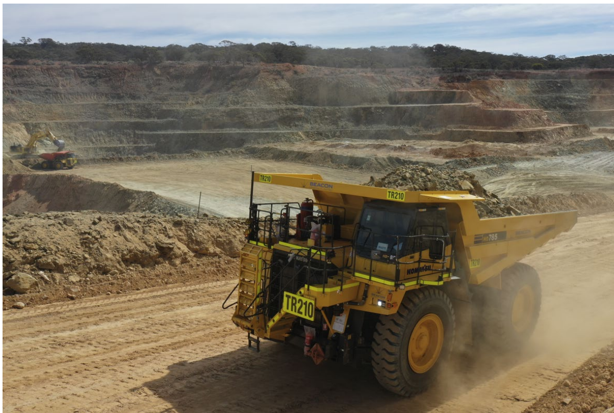
Figure 3 – Third New Komatsu 785-7 (TR210) arrived on site 17 March 2024