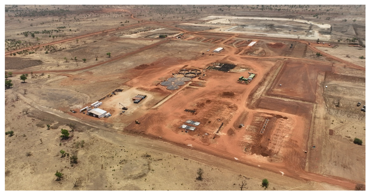
Kiaka Mill and CIL Areas