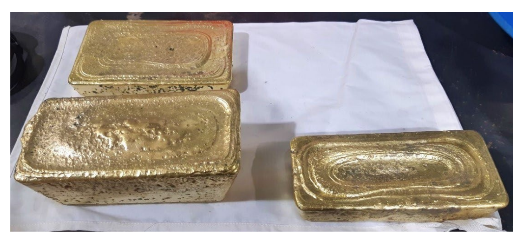
Figure 1: CIL Bars on the left and latest gravity bar on the right from Warrawoona

The processing plant is fully operational and has achieved milling rates of 2.2Mtpa with the full ramp up to 2.4Mtpa expected to be completed this quarter.