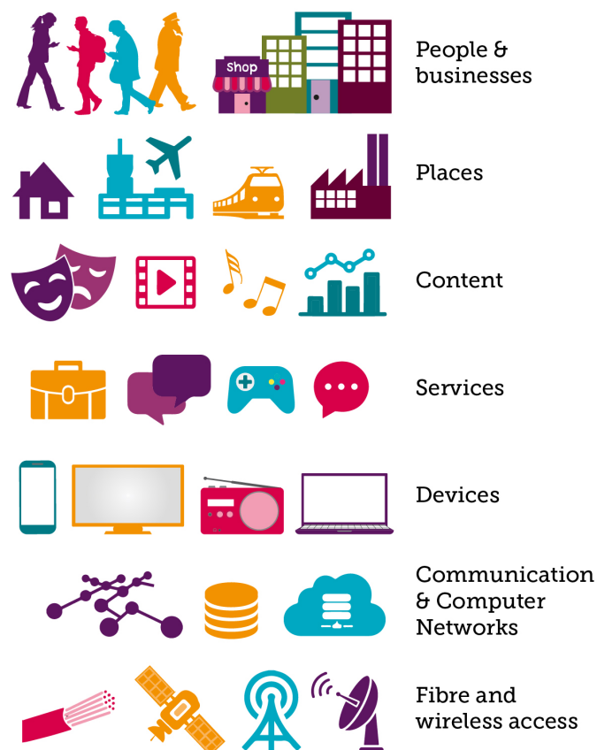
Figure 1: Scope of Ofcom's emerging technology programme.