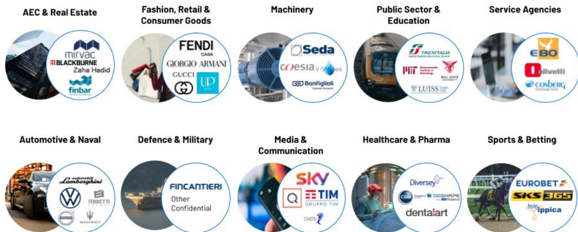
Figure 1: Customer Portfolio (selection)

Vection has commenced FY22 strongly, securing ~$1.8M in FY22 Total Contract Value (TCV) across multiple sectors. The Company addresses the AEC & Real Estate - Fashion, Retail & Consumer Goods - Machinery - Public Sector & Education - Service Agencies - Automotive & Naval - Defence & Military - Media & Communication - Healthcare & Pharma - Sports & Betting verticals.