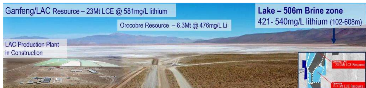
Figure 1. Location of Lake’s Cauchari results in relation to the Lithium America’s production development.